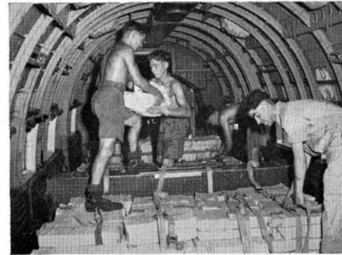
Preparing leaflets for dispatch.

"My mind was full of thoughts of my girl friend, starvation, liquidation, the contents of Government leaflets, and voice aircraft. Finally the Government