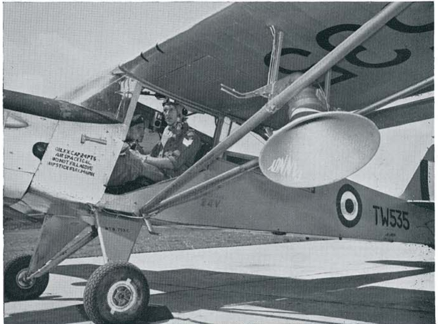
The voice of P.W.: An Auster 4 fitted with loudspeakers. The starboard speaker, which is not visible in this picture, is canted to port.

and 'voice' aircraft, and by an indirect campaign conducted through the Press, radio, films, and addresses to the civil population. Valetta supply-dropping air-