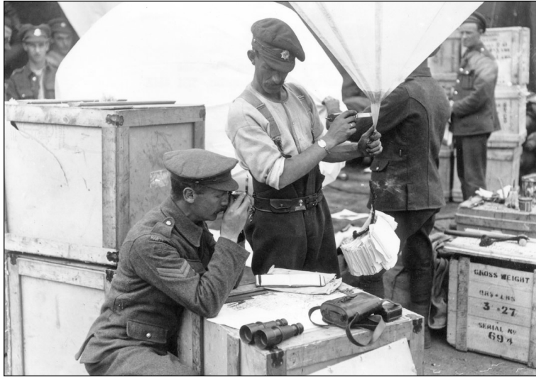
Checking wind direction before a balloon release. France, 14th September 1918.

Lord Northcliffe, who had been appointed Director of Propaganda in Enemy Countries in February 1918, repeatedly pressed for the raising of the embargo on