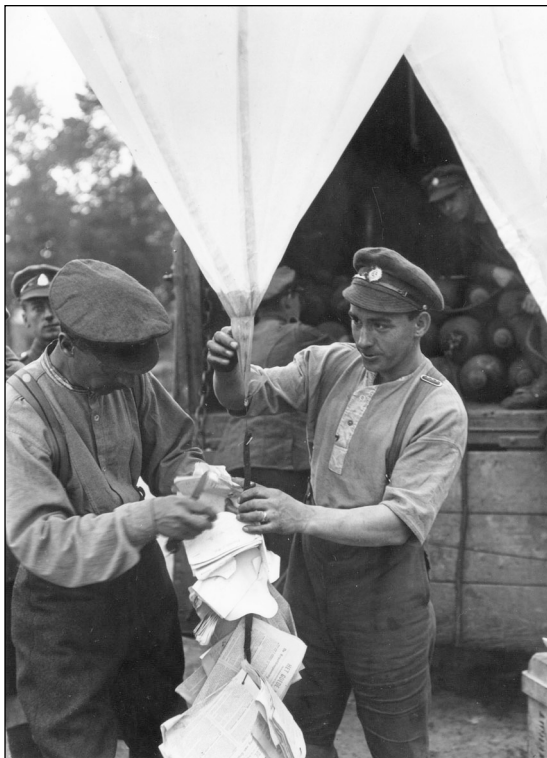
Men of the Hampshire Regiment attaching leaflets to a balloon, near Bethune, France, 14th September 1918. (Crown Copyright)

"Attention was then directed to alternative methods of distribution and after various suggestions had been investigated it was eventually decided to utilise special balloons for the purpose. In its standard form the propaganda balloon was manufactured at the rate of nearly 2,000 a week. It was made of paper, cut in ten longitudinal panels, with a neck of oiled silk about 12 inches long. The circumference was about 20 feet and the height, when inflated, over 8 feet. The absolute capacity was approximately 100 cubic feet but the balloons were liberated when not quite taut, containing 90 to 95 cubic feet of hydrogen. Leakage of gas was restricted by the use of a suitable "dope" which prevented appreciable diffusion of the gas for two or three hours. The load consisted of some 500 to 1,000 leaflets which were released in batches by the burning of specially prepared cotton wick, similar to that used in flint pipe-lighters. Although runs of 150 miles were possible with the balloons produced at the time